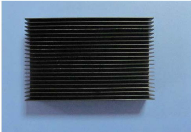
Figure 1. The Physical Photo of Heat Sink